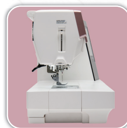
Improved Ergonomic Design