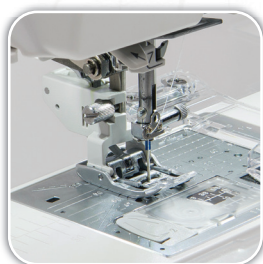
Detachable AcuFeed™ Flex Layered Fabric Feeding System