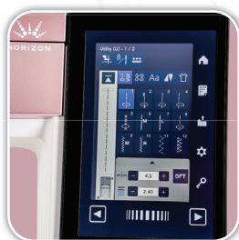
High-Def 5" LCD Color Touchscreen