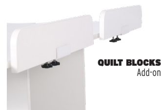
QUILT BLOCKS Add-on