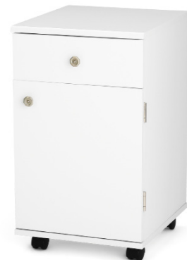
Suzi Storage Cabinet

There can never be too much storage space in your sewing room! Arrow's dedicated storage cabinets are designed for organization and accessibility. Arrow's Suzi , features 4 dedicated storage drawers and comes in Oak and White finishes! Cute and functional!