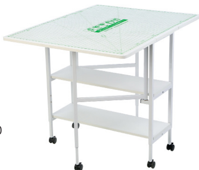
Dixie Cutting Table

Arrow sewing cabinet - check! Now add even more convenience to your studio with a dedicated cutting table like Dixie , specially designed to complement your primary Arrow sewing cabinet. Add style, storage and comfort to your growing sewing oasis!