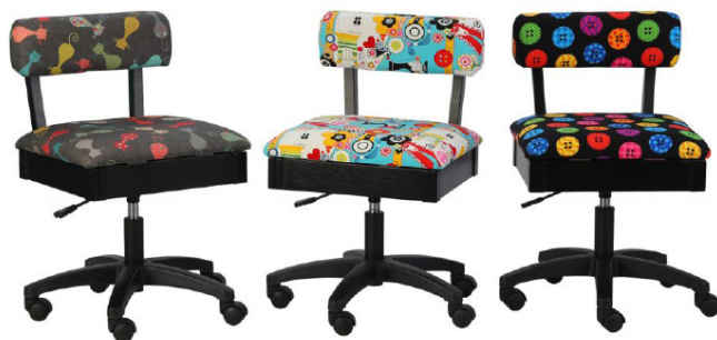
Cat's Meow, Sew Wow Sew Now & Bright Buttons Chairs

The cherry on top of your sewing sundae! Arrow's #1 Rated Height Adjustable Sewing Chair is a must have accessory for your dream sewing room! Cute, comfortable and convenient - our lovable chairs feature vibrant sewing themed patterns, 360° swivel access and lumbar support for long hours at your workstation. Don't look now, but under every seat cushion is a hidden storage compartment to store your notions and patterns! Available in 10 colors to perfectly match your sewing sanctuary!