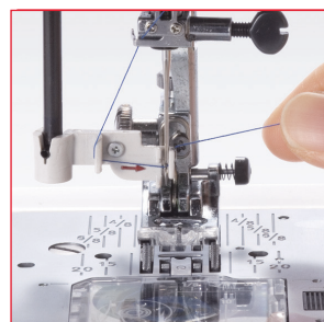
Built-In Needle Threader