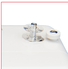
Auto Declutch Bobbin Winding