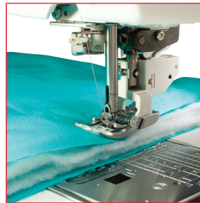
AcuFeed Flex Layered Fabric Feeding System