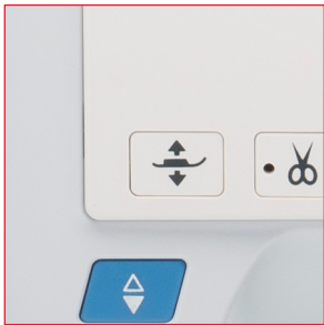
Automatic Presser Foot Lift