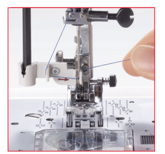
Built-In Needle Threader