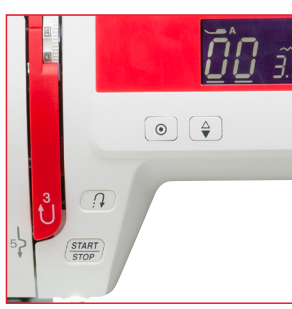
Easy Convenience Buttons